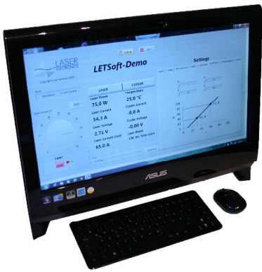
PC with LETSoft program